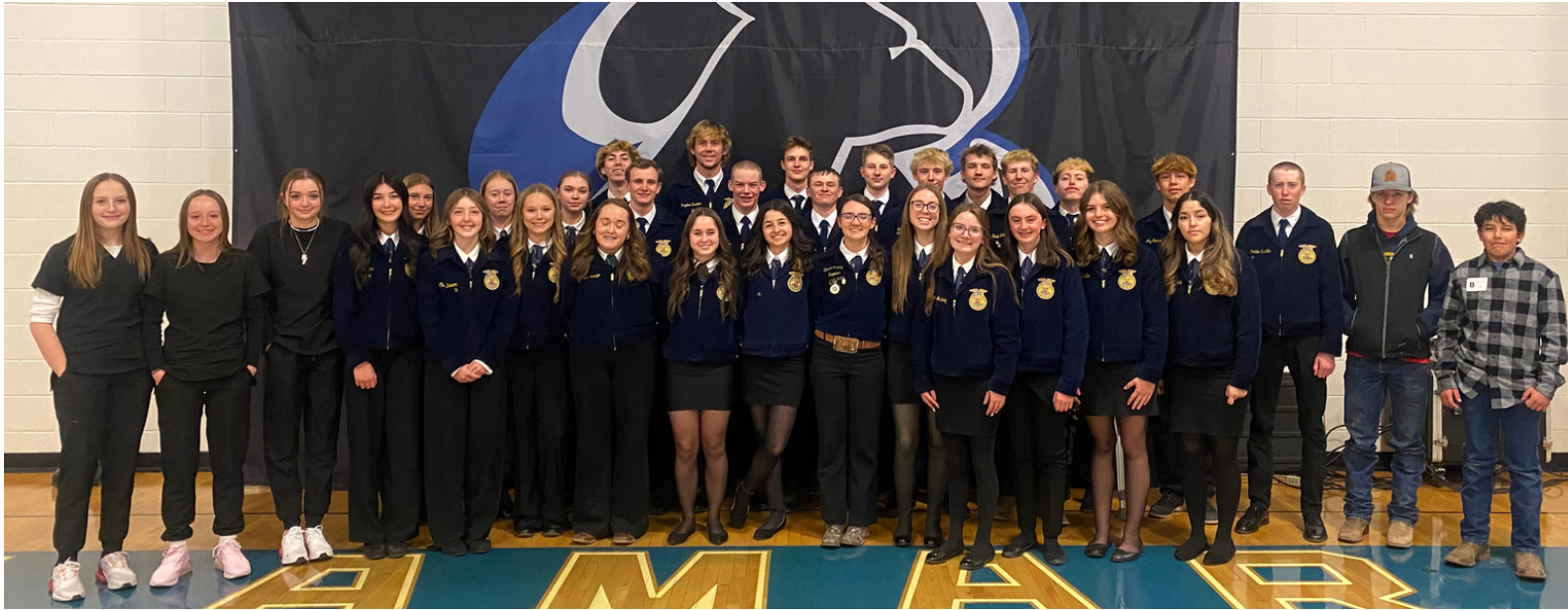
Sargent FFA Chapter at Regional CDE Contests at Lamar Community College.