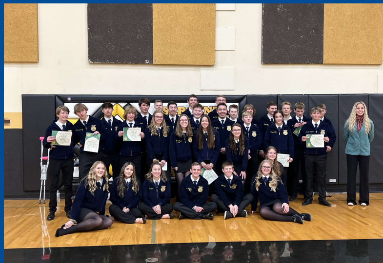
FFA MEMBERS AT GREENHAND BANQUET