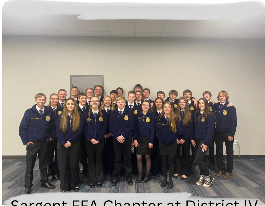
Sargent FFA Chapter at District IV Leadership Conference