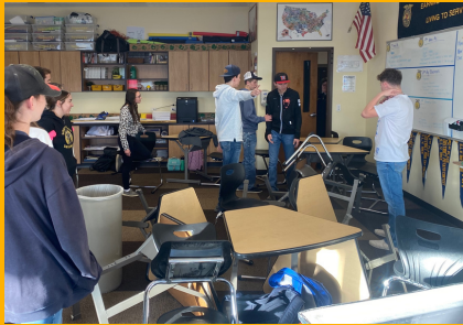
FFA MEMBERS DURING STATE OFFICER VISIT