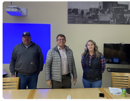
Board of Education Not pictured: Lorena Price