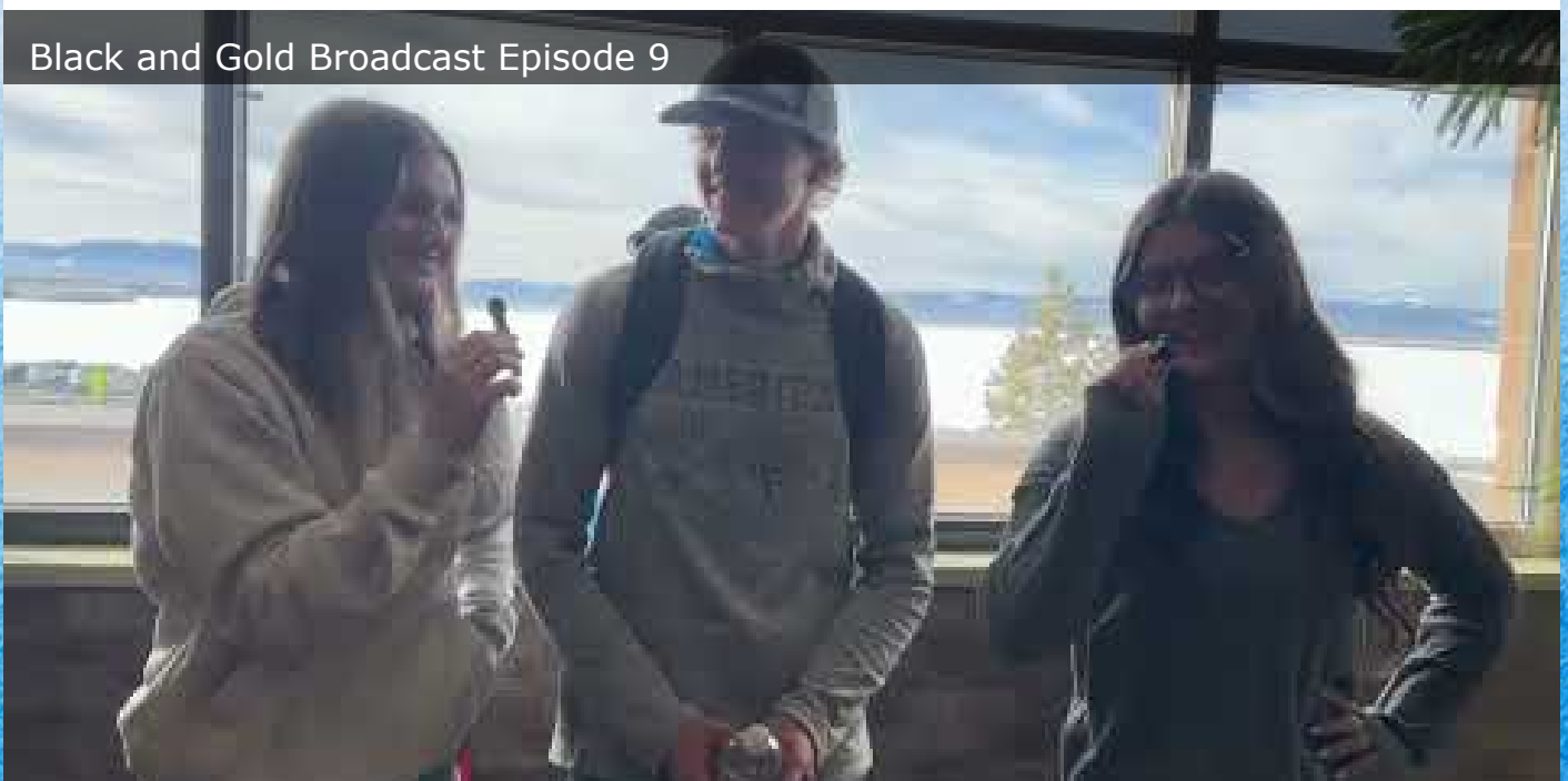
Black and Gold Broadcast Episode 9